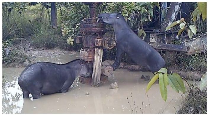
Tapirs licking oil from a poorly sealed oil well, Loreto, Peru.

Abstract: to reduce the risk of catastrophic climate change a large share of existing fossil fuels reserves has to be kept underground. This basic fact can be challenged only by climate skeptics and technological optimists. The former are in denial of climate change and/or of its anthropogenic root, the latter believe in the massive development of (yet non-existent) capture and storage technologies within the next few decades. Notwithstanding the relatively uncontroversial nature of the fact that a large share of fossil fuel reserves are 'unburnable', little progress has been made to identify the specific reserves that should be left untapped and the way the costs of the policy should be met. This presentation is going to explore the methods to develop spatially-explicit and just proposals for specifying the reserves that need to be labelled unburnable and the way these proposals intersect and can contribute to global environmental justice.